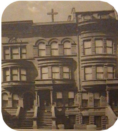
St. Joseph's of the Sacred Heart Our First Convent, New York City