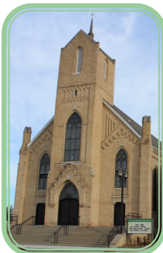
St. Vincent de Paul Church, Elkhart, IN