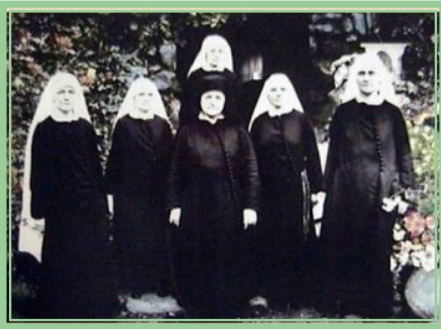
Mother and the first group of novices.