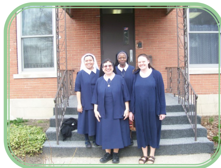
Parish Visitors on pilgrimage to the Convent at St. Vincent de Paul, Elkhart