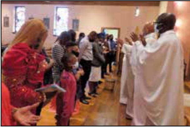
The priests bless Sisters' relatives and friends after they brought their gifts to the altar.