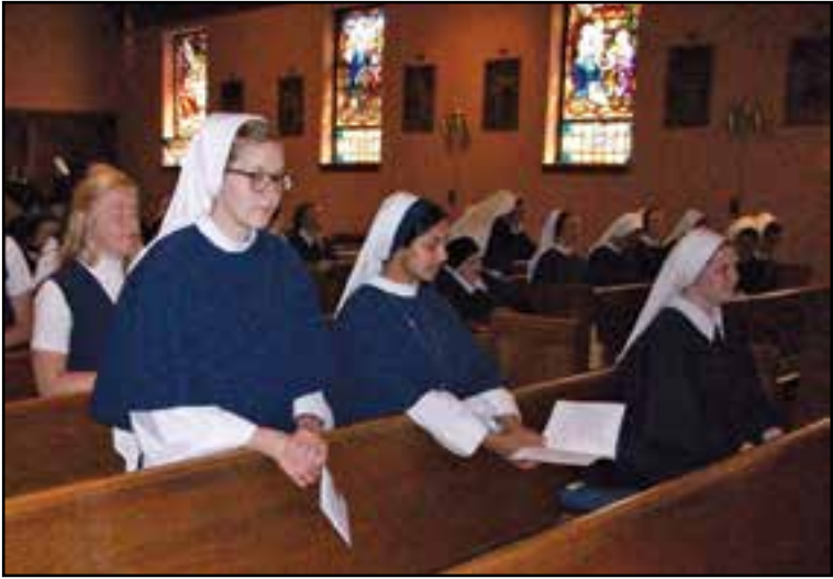
For some postulants, novices and junior professed this was their first trip to Marycrest. They were able to tour St. Joseph's building where the Sisters of Life began in 1991.