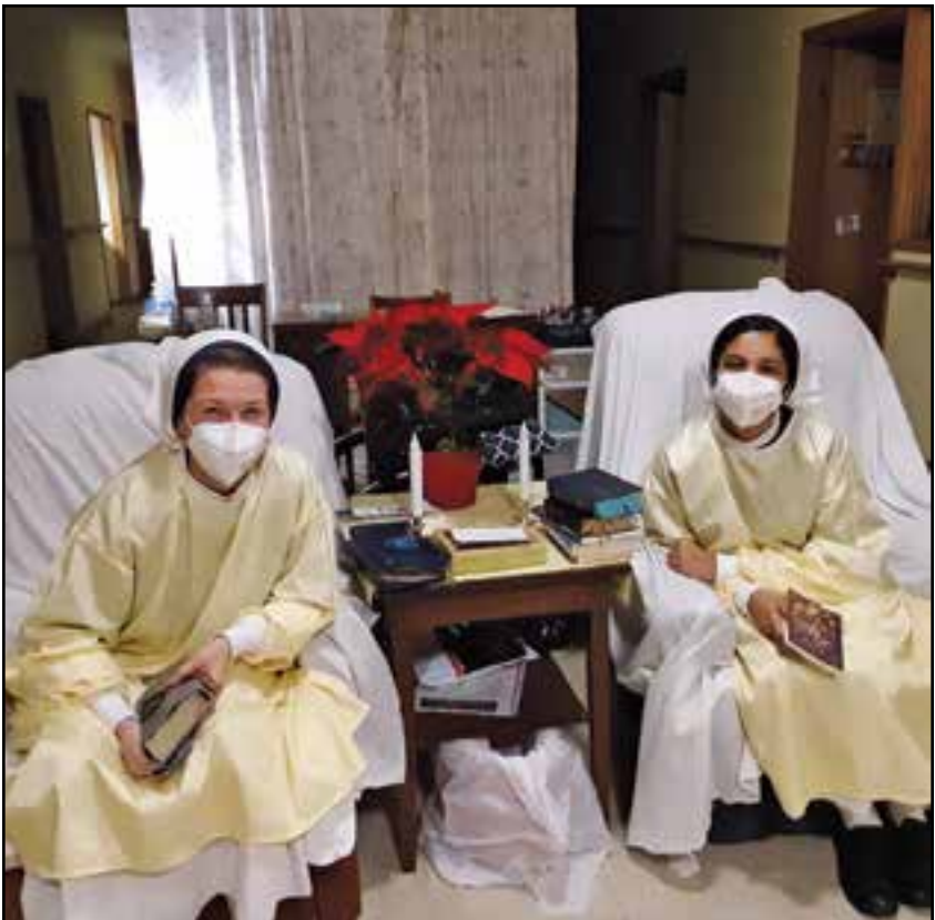
Two of the Sisters of Life who covered the night shift in our infirmary.

The very next day three Sisters of Life came to Marycrest to serve as our night nurses and the following week the 4th Sister joined them. Every night for 2 weeks the Sisters were on duty in the Infirmary, caring for our Sisters so lovingly and joyfully! What a gift they were!!!!