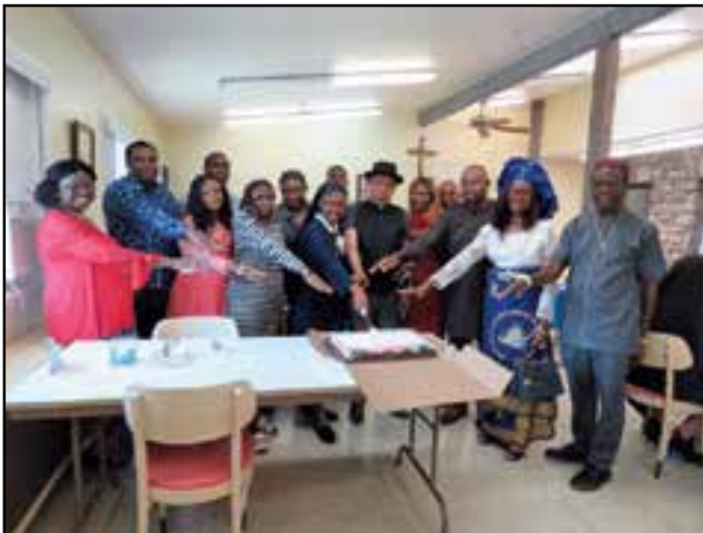
It is our custom that when a Sister Jubilarian cuts the cake we all say a silent prayer for her intentions