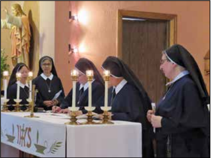
They sign their vows on the altar of sacrifice