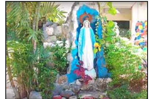
A sign of the community's devotion to our Blessed Mother and their openness to hear and experience God in their midst.)

With this to consider, Sister had to include the essential topics from 6th to 8th Grade in her lesson plan for the year. The principal, teachers, staff, and students are grateful to have a Sister in their School to help them know, love, and serve the Lord better.